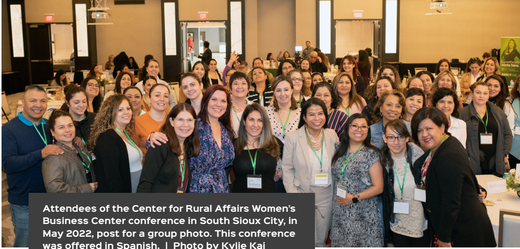
Attendees of the Center for Rural Affairs Women's Business Center conference in South Sioux City, in May 2022, post for a group photo. This conference was offered in Spanish.