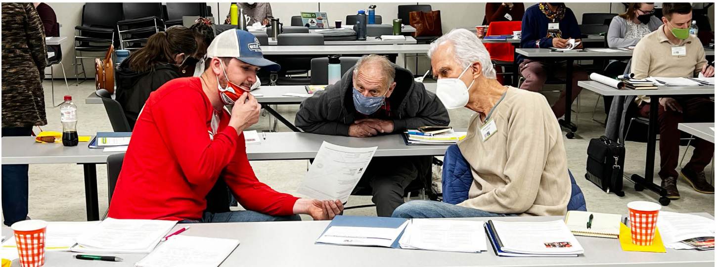
Farm to School programming in Nebraska expanded this year with a training exclusively for producers. Nineteen farmers joined in the session and left motivated to educate students and serve the nutritious food they work so hard to make.