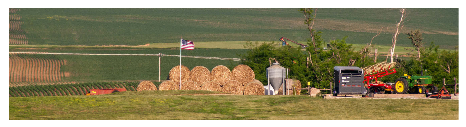
The Center is supporting farmer veteran leaders in forming a Farmer Veteran Coalition chapter in our home state of Nebraska. This chapter helps veterans transition from military service into careers in agriculture.