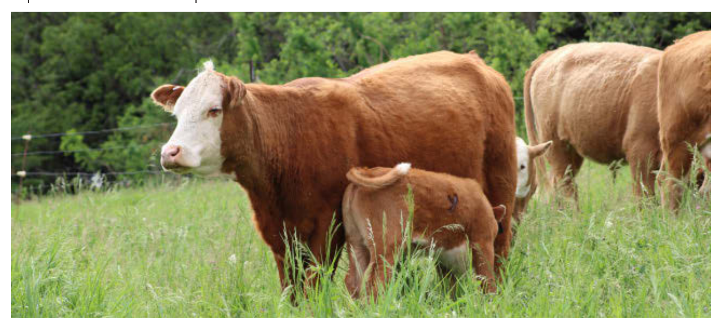
Prescribed grazing is one method producers use to improve the resiliency of their pastures. In times of drought, this practice can help ensure producers do not overgraze while maintaining the health of their livestock.