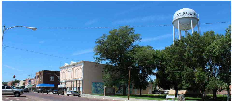
Rural communities can benefit from new resources on applying for federal grants, a grant application guide and a grant writer resource list.

“The guide provides tips and information for identifying grant opportunities, preparing to apply, setting a timeline, and writing and submitting an application,” she said. “Additionally, the guide lists commonly used terms and phrases associated with grant application processes.”